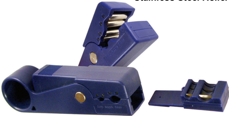
Pre-Set Blade Cartridge